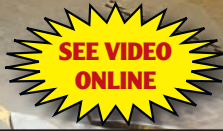
2006 KINETIC MDL. K2500-DA 2,500-WATT CNC PLASMA CUTTING TABLE, 120" X 480" CUTTING CAP., EST. 20' X 50' WORKTABLE WITH (2) HYPER THERM MDL. HPR260 PLASMA CUTTING UNITS, THERMCO MDL. 6105CA30A1100 GAS MIXTURE, S/N 28266, ASSET #000239, (2008), 0-2,000 SCFH CAP., THERMCO MDL. 6105CA30A1175 GAS MIXTURE, S/N 17682, (2013), 0-2,410 SCFH CAP., (LOCATED: 850 AEROPAZA DRIVE, COLORADO SPRINGS, CO).