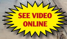
2013 MESSER TITAN 16/4 HIGH DEFINITION LP PLASMA CUTTING SYSTEM, APPROX. 120" X 480" TABLE SIZE.