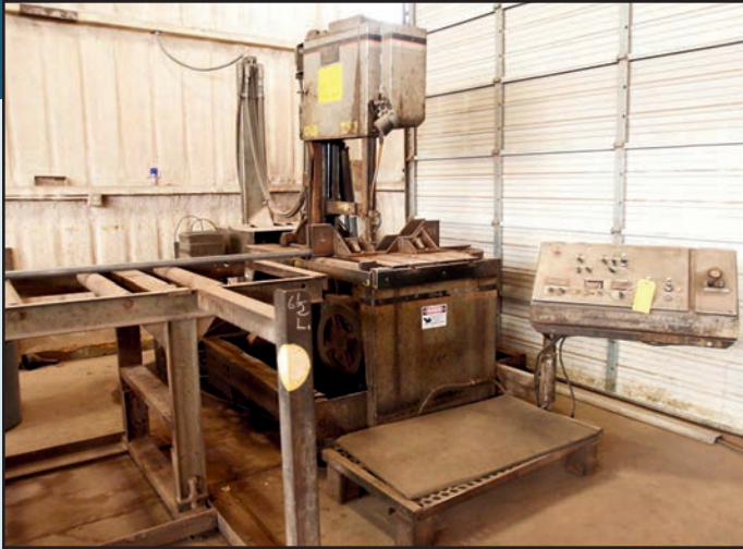
HEM SAW V130HM VERTICAL BAND SAW.