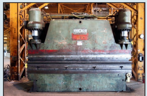
CHICAGO 300-F-10 PRESS BRAKE, (NO DIES).