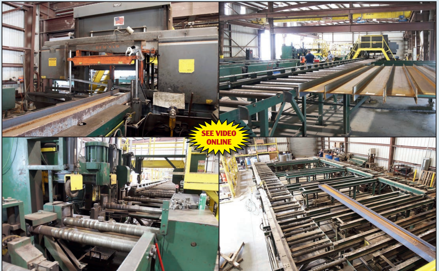
2007 CONTROLLED AUTOMATION PUNCH LINE AND HEM SAW, WITH DRAG STYLE INFEEED CONVEYOR, LIFT AND CARRY OUTFEED CONVEYORS.