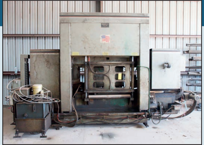
HEM SAW WF190M-DC HORIZONTAL BAND SAW.