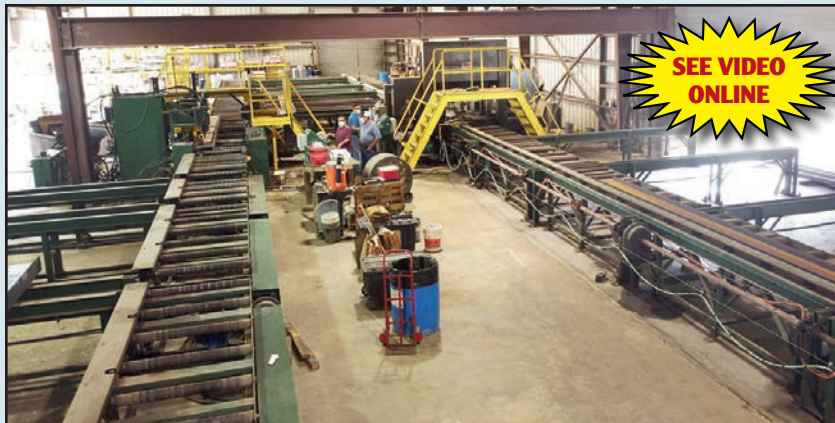
2007 CONTROLLED AUTOMATION PUNCH LINE AND HEM SAW, WITH DRAG STYLE INFEED CONVEYOR, LIFT AND CARRY OUTFEED CONVEYORS.