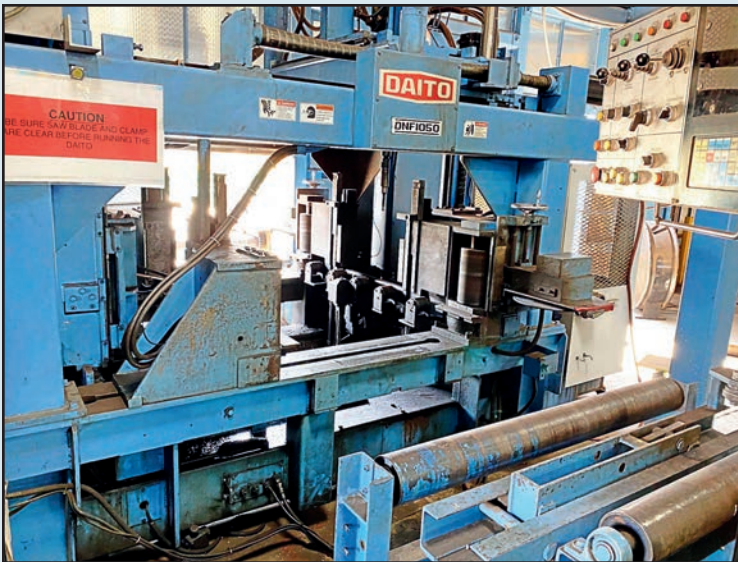
2001 DAITO DNF-1050 3-SPINDLE CNC BEAM DRILL LINE, DAITO CONTROL, 40" MAX. PROFILE WIDTH, 3" MIN. PROFILE WIDTH, 20" MAX. PROFILE HEIGHT, 6" MIN. PROFILE HEIGHT, (3) SPINDLES, 5 HP SPINDLE, 680 RPM SPINDLE SPEED, 2" MAX. HOLE SIZE, S/N 12NM2-3.

Large Quantity of Press Dies & Brakes Available Usable Steel, Plate, Flat, Bar & Angle