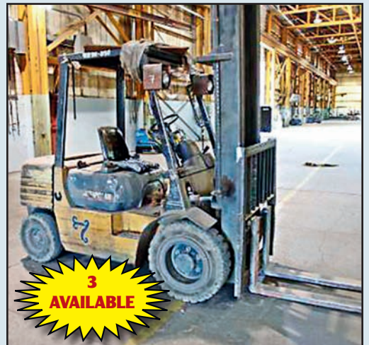
CATERPILLAR DP70 FORKLIFT, 15,500-LB. CAP., 197" LIFT HEIGHT, PNEUMATIC TIRES.