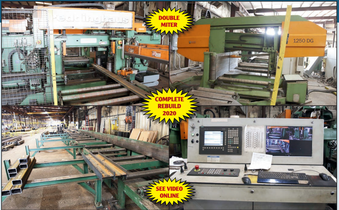
2011 PEDDINGHAUS PCD 1100 DRILL LINE, WITH MULTIMASTER, 2020 COMPLETE REBUILD, 1250 DG SAW, NEW HENNING CHIP CONVEYOR, WITH INFEEED AND OUTFEED CONVEYORS.