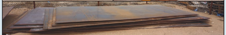
VIEW OF USEABLE STEEL, PLATE, FLAT, BAR AND ANGLE