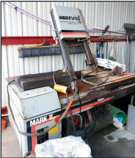
MARVEL 8 MARK II VERTICAL BAND SAW.