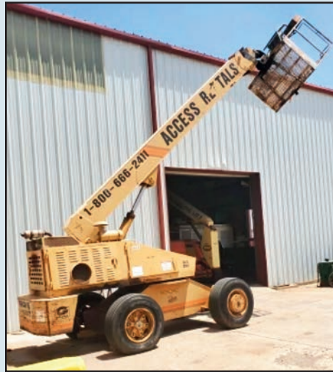
GROVE MZ 66A MANLIFT, APPROX. 60' REACH, 7,983 HOURS.