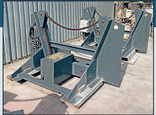
(4) EMS EC-16 COLUMN BEAM ROTATORS, 16-TON CAP. PER SET, 60' MAX. LENGTH, 10' MIN. LENGTH, 3/220/440/60 VOLTAGE, (LOCATED: SCW CONTRACTING CORP., FALLBROOK, CA).

Large Quantity of Press Dies & Brakes Available Usable Steel, Plate, Flat, Bar & Angle