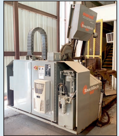
MARVEL F215010227TS HORIZONTAL BAND SAW, 20" X 25" CAPACITY 20" X 17" @ 45° CAPACITY, 30-650 FPM BLADE SPEED WITH INFEEED AND OUTFEED CONVEYORS.