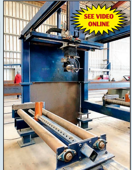
2015 PEDDINGHAUS OCEAN LIBERATOR CNC OXY COPER MACHINE, SIEMENS 840D CONTROL, MAX. PROFILE WIDTH 44", MAX. PROFILE HEIGHT 24", MAX. MATERIAL THICKNESS 6", (1) TORCH, S/N A002623.