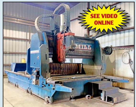
QUICKMILL MDL 9618024 GANTRY TYPE CNC MACHINING CENTER, RETROFITTED 2011, FANUC OI CONTROL, 3,000 RPM, 150 PSI, Y-96", X-180", Z-24" TRAVELS, 3,569 HOURS, S/N 4079.