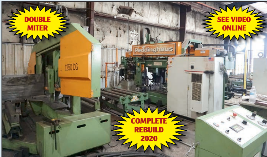
2011 PEDDINGHAUS PCD 1100 DRILL LINE, WITH MULTIMASTER, 2020 COMPLETE REBUILD, 1250 DG SAW, NEW HENNING CHIP CONVEYOR, WITH INFEED AND OUTFEED CONVEYORS.

ONLINE BIDDING: YOU MUST REGISTER IN ADVANCE FOR ONLINE BIDDING AT THIS AUCTION BidSpotter.com