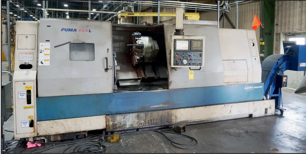
2006 DOOSAN PUMA 400L CNC LATHE