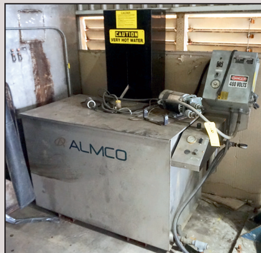
ALMCO PARTS WASHER