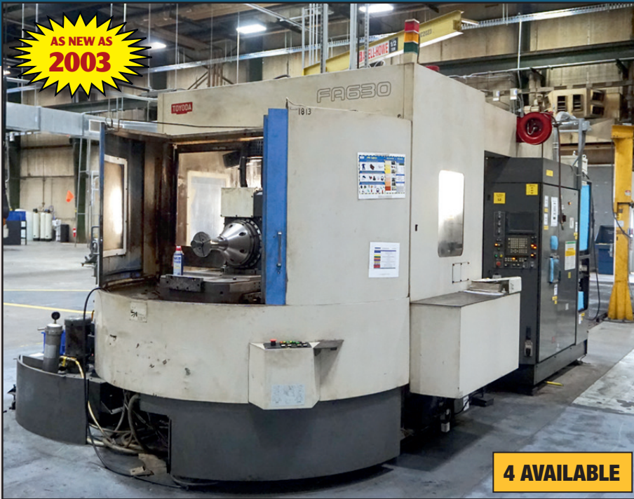
TOYODA FA630 HORIZONTAL MACHINING CENTER