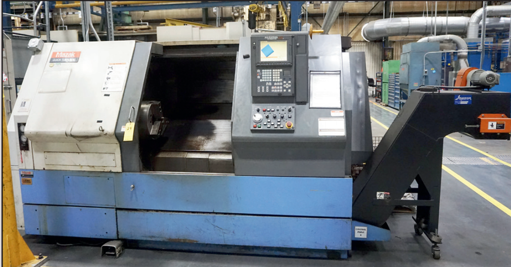
1999 MAZAK QT-35XS CNC TURNING CENTER