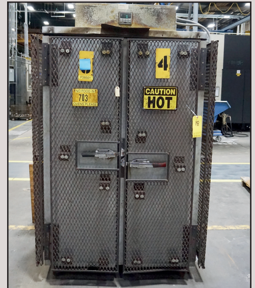
450 DEGREE OVEN