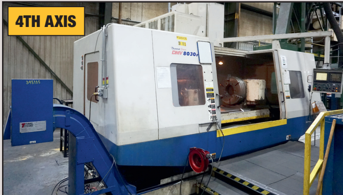
DOOSAN DMV 8030S CNC MACHINING CENTER, WITH 4TH AXIS ROTARY