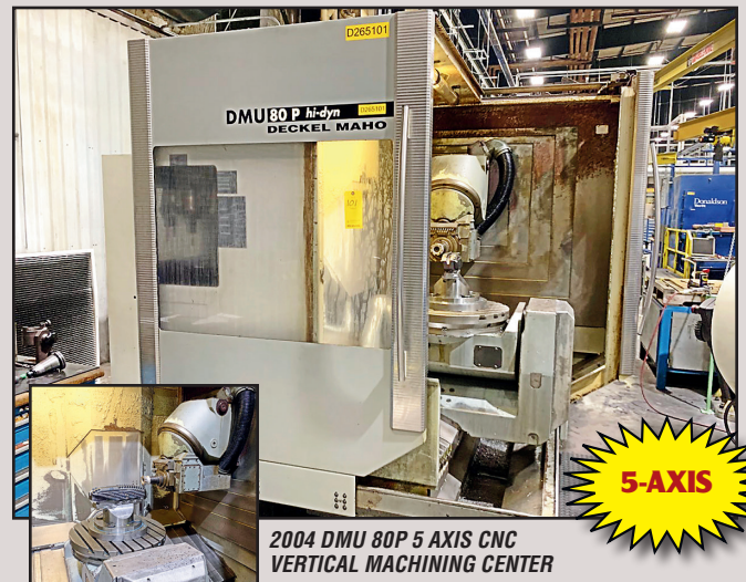
2004 DMU 80P 5 AXIS CNC VERTICAL MACHINING CENTER