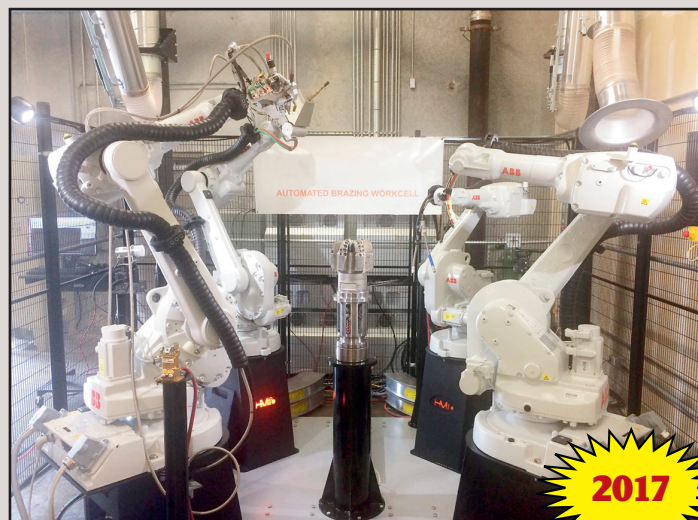
(4) 2017 ABB IRB 1600 ROBOTS