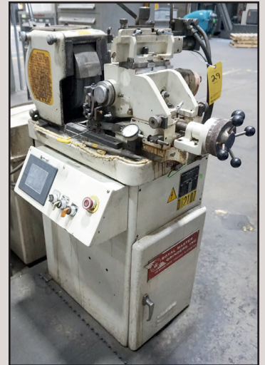
ROYAL MASTER MDL. TD GRINDER, 12X4