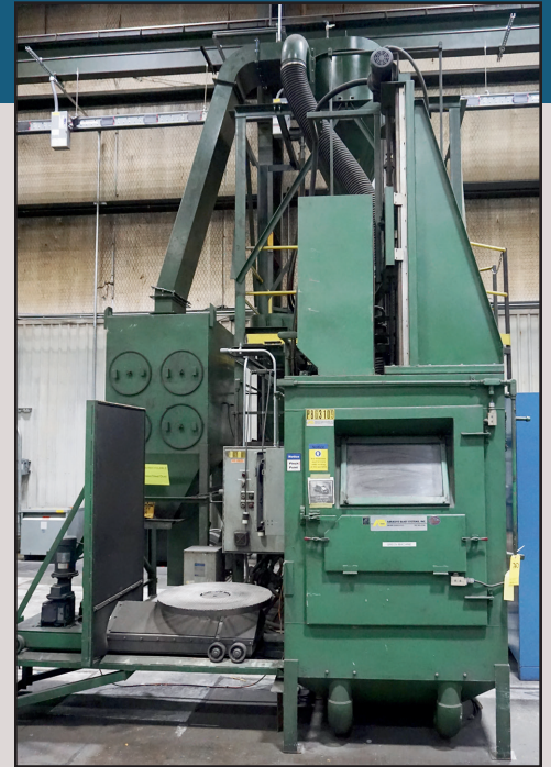
ABRASIVE BLAST SYSTEMS INC. ROTARY BLAST SYSTEM