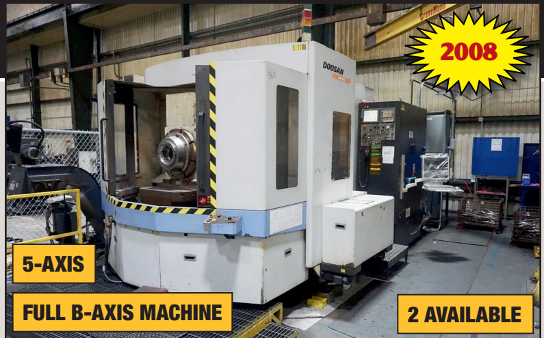
(2) 2008/2007 DOOSAN HM630 HORIZONTAL MACHINING CENTER, WITH 5-AXIS ROTARY PALLETS, 120 ATC