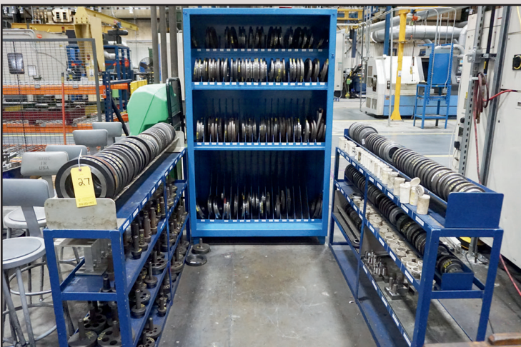
(3) RACKS OF RING AND PLUG GAGES