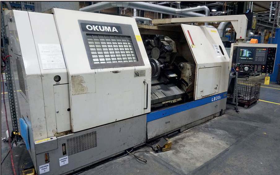
OKUMA LB 35II CNC LATHE