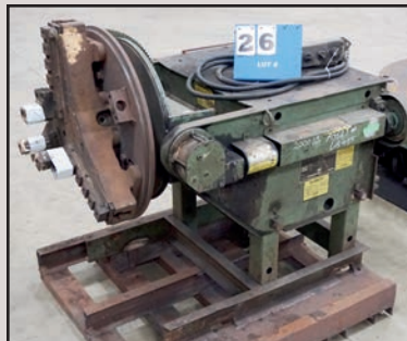
KOIKE ARONSON 20A-PTUR2 WELDING POSITIONER, 2,000-LB. CAP., POWER TILT, POWER TURN