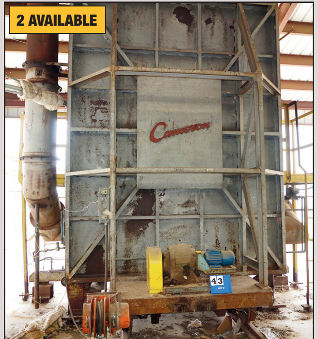
MAXON 2000 DEGREE FURNACE, 6' X 6' OPENING