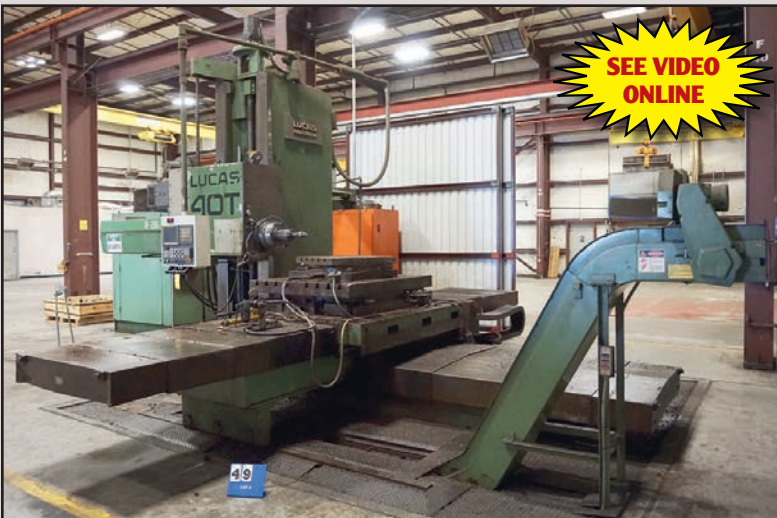
LUCAS 40T HORIZONTAL BORING MILL