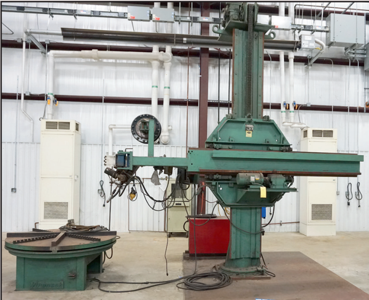
RANSONE 1212 MANIPULATOR, WELDING POSITIONER, W/POWER TURN, LINCOLN IDEAL ARC DC-600 WELDING POWER SOURCE W/LINCOLN NA 3N WIRE FEEDER