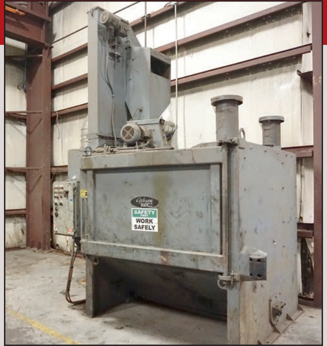
GIBSON METAL SHOT BLAST, 72" WIDE TABLE, 42" MAX. HEIGHT