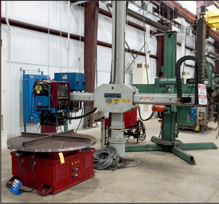
2001 PRESTON EASTON MA88MD WELDING MANIPULATOR, VERTICAL TRAVEL 8', HORIZONTAL TRAVEL 8', LIFT RANGE 10', W/THERMAL ARC ARCMASTER 351 POWER SOURCE, ARC SPECIALTIES CONTROL W/HOT ONE HOTWIRE POWER SUPPLY, WELDING POSITIONER W/POWER TURN