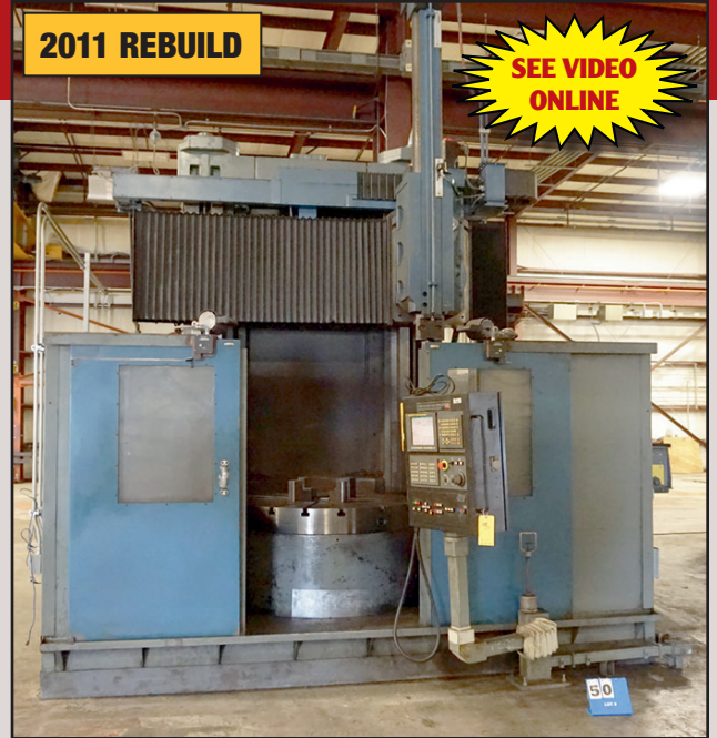
BULLARD CNC VERTICAL TURRET LATHE, REBUILT BY ESSET IN 2011, 56" 4-JAW CHUCK