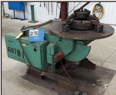
ARONSON HD306A WELDING POSITIONER, 2,000-LB. CAP., 40", W/POWER TILT, POWER TURN