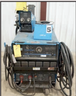
MILLER DIMENSION 462 W/WIRE FEEDER