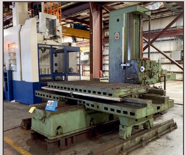
GIDDINGS & LEWIS MDL T-5 HORIZONTAL BORING MACHINE