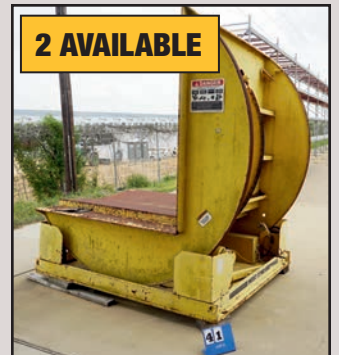
BOP COIL UP ENDER FLIPPER