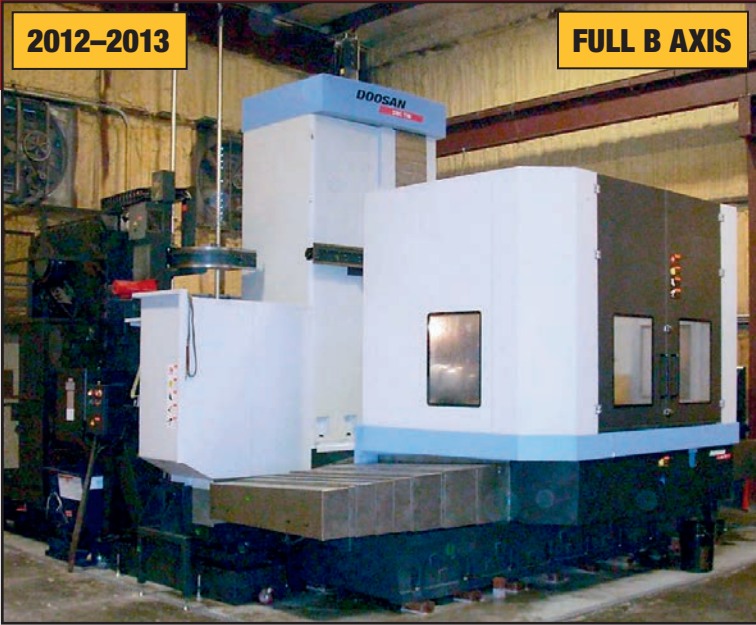
(1 OF 2) 2012-2013 DOOSAN DCB 110 AND DCB 110S HORIZONTAL BORING MILLS, TABLE 55" X 70", 22,000-LB. CAP., TRAVELS: X-98", Y-78", Z-59", 4,000 RPM SPINDLE, 60 ATC. LOCATED IN OKLAHOMA CITY, CURRENTLY DISASSEMBLED