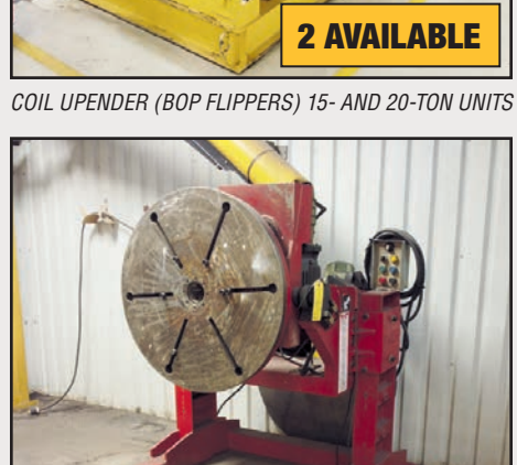
WELDING POSITIONER, POWER LIFT AND POWER TURN