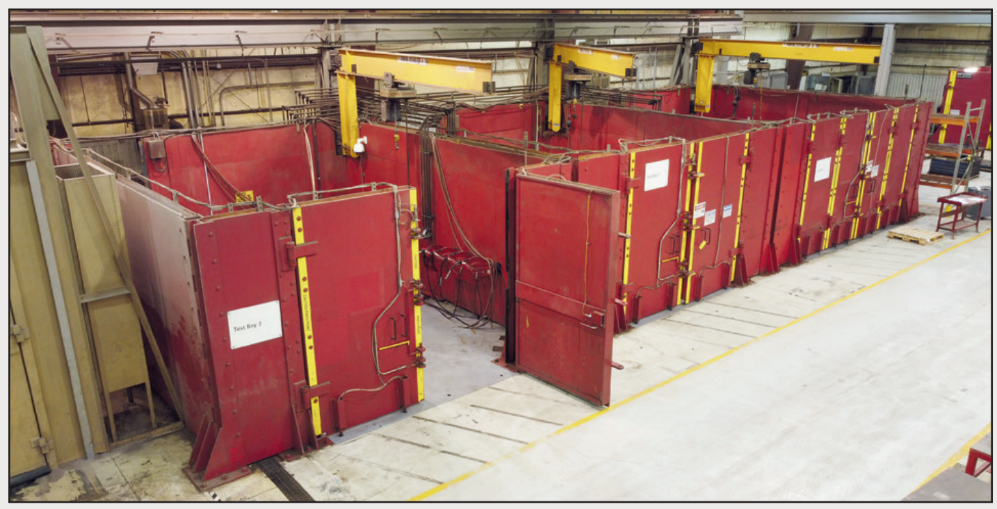
RBI BUNKERS, (2) 21'D. X 17'W. X 10'T., (1) 21'D. X 22'W. X 10'T.