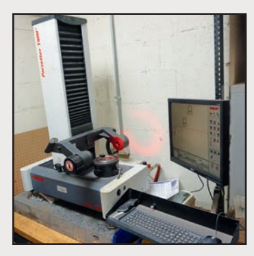
2011 PARLEC 1500 SERIES TOOL PRESETTER

GIDDINGS & LEWIS MAG RT-1250, 6.1" spindle diameter, spindle motor: 60 /74 HP, spindle speeds (4 speed ranges): 3,500 RPM, 50 spindle taper, X-axis travel: 98.4", Y-axis (vertical) travel: 86.6", Z-axis (spindle) travel: 31.5", W-axis (saddle) travel: 59.1, table size: 49.1" x 63", table rotation: full 4th axis, table load capacity: 50,000-lb., 60 ATC, feeds: X, Y, Z-axes: 984 IP, rapids: X, Y, Z-axes: 984 IPM. Equipped with: Fanuc 310iA control, chip conveyor, coolant thru spindle (230 PSI), flood coolant, Renishaw RMP 60 probe, mist collection, works with ITS tooling, cam lock with manually loaded cover P, manual cam lock latch plate with cover plate for 90 deg., right angle adaptation, and full enclosure!