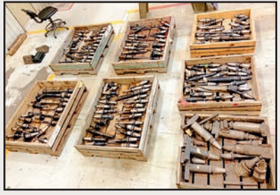
VIEW OF TOOLING AND INSERTS