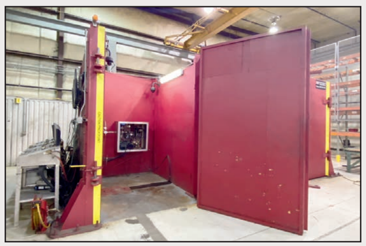
INSIDE VIEW OF BUNKER