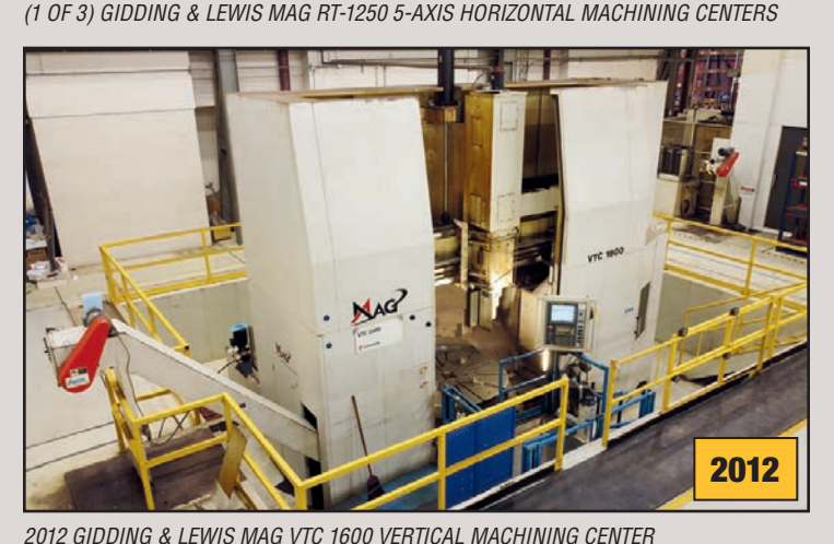
2 GIDDING & LEWIS WAG VIC 1000 VENTICAL WACHINING CENTER