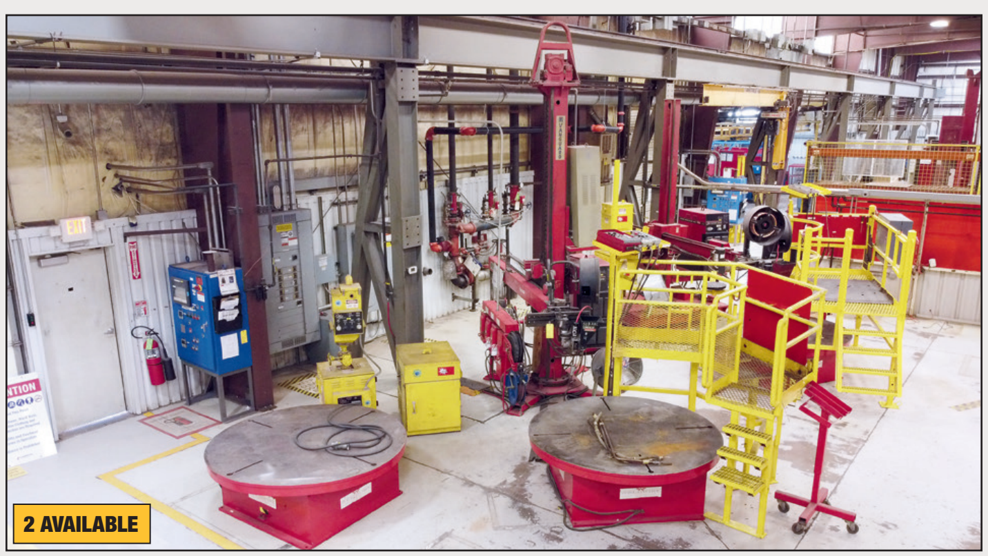
VIEW OF WELDWIRE SUB ARC WELDERS, (2) POSITIONERS WITH LINCOLN POWERWAVE AC/DC 1000 POWER SOURCE AND WELD ENGINEERING MM-3000 FLUX RECOVERY VACUUM AND DUST COLLECTOR