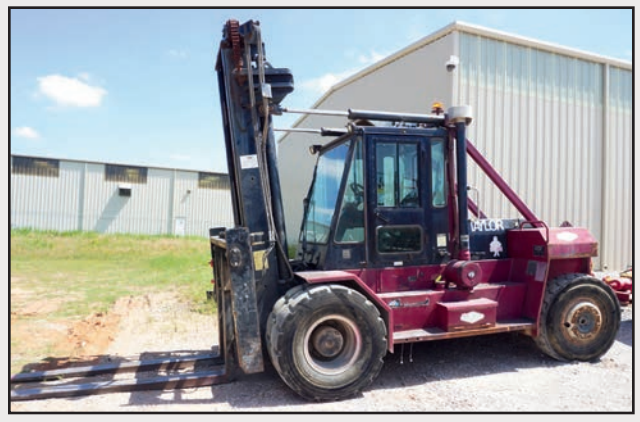
TAYLOR T-300M 27,000-LB. CAP. FORKLIFT