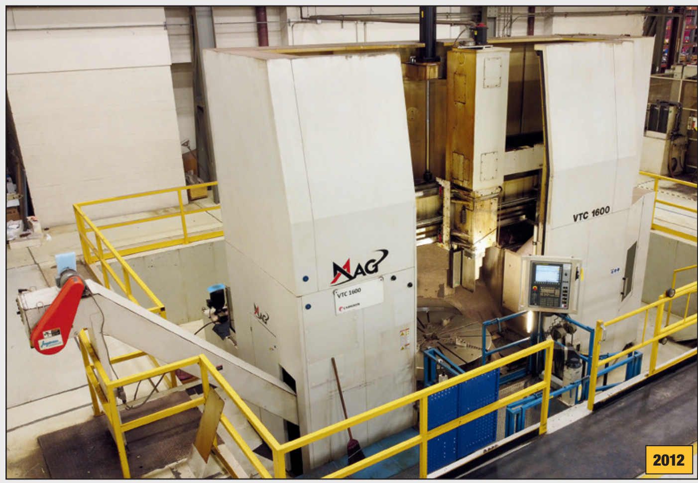
2012 GIDDING & LEWIS MAG VTC 1600 VERTICAL MACHINING CENTER

GIDDINGS & LEWIS MAG VTC 1600 , 63" table diameter, max. swing 78.7", max. facing capacity 78.7", max. height under rail 78.7", X-axis travel (± of center) 47.4", Z-axis travel 49.2", table load capacity 33,000-lb., table speed: 1–400 RPM. Equipped with: Fanuc 31i-A CNC control, KM80 modular tool holding system, wedgelock tool holding system, chip conveyor, thru ram coolant, flood coolant, tool and part Renishaw probe.