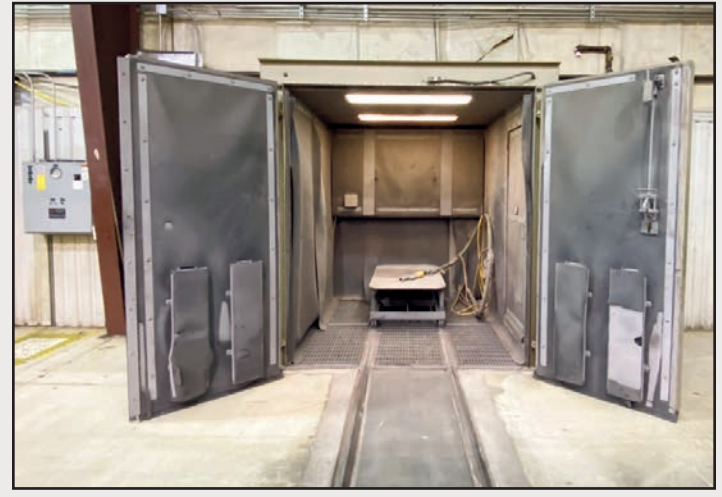
CLEMCO BLAST CABINET, 8.5'D. X 7'W. X 9'T.