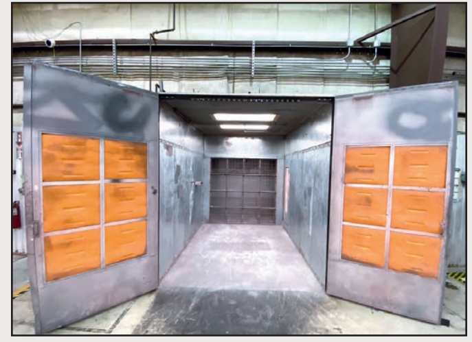
PAINT BOOTH, 10'D. X 8'W. X 10'T.

ONLINE BIDDING: YOU MUST REGISTER IN ADVANCE FOR ONLINE BIDDING AT THIS AUCTION