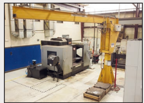
(2) FLOOR MOUNTED AND (20) COLUMN MOUNTED JIB CRANES