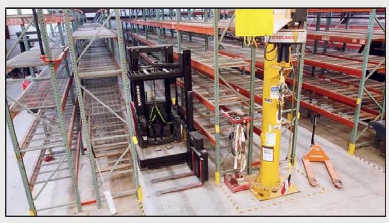
(4) COMPLETE RAYMOND SWING REACH LIFTS