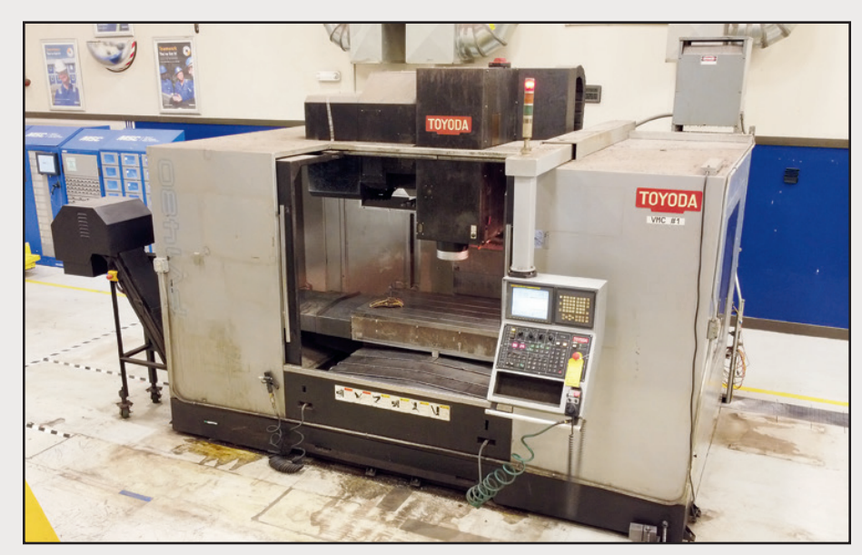
TOYODA FV-1480 VERTICAL MACHINING CENTER, X-AXIS TRAVEL 55", Y-AXIS TRAVEL 31", Z-AXIS TRAVEL 27", FANUC 18i MB CONTROL, 50 TOOL TAPER, MAX. SPINDLE SPEED 6,000, 30 ATC, WITH CHIP CONVEYOR.

GIDDINGS & LEWIS MAG VTC 1600 , 63" table diameter, max. swing 78.7", max. facing capacity 78.7", max. height under rail 78.7", X-axis travel (± of center) 47.4", Z-axis travel 49.2", table load capacity 33,000-lb., table speed: 1–400 RPM. Equipped with: Fanuc 31i-A CNC control, KM80 modular tool holding system, wedgelock tool holding system, chip conveyor, thru ram coolant, flood coolant, tool and part Renishaw probe.