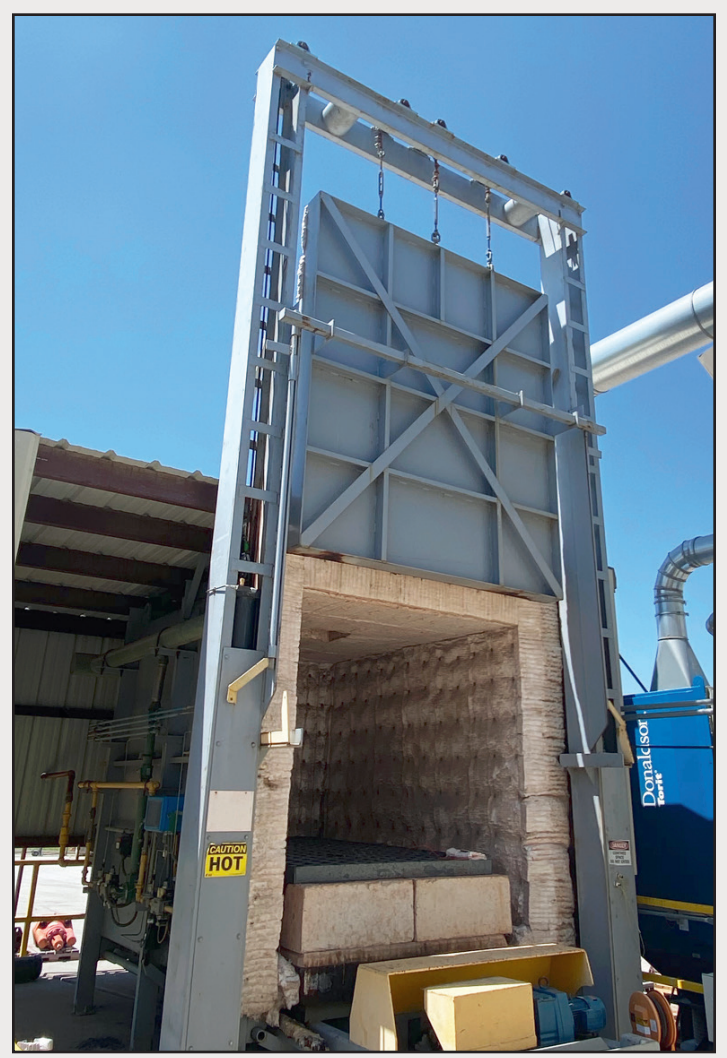
BLAGRAVE & DUFFEY 1,850 DEGREE GAS STRESS RELIEVING FURNACE