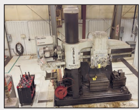
CARLTON RADIAL ARM DRILL