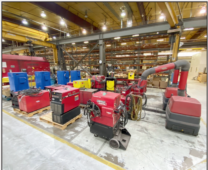
VIEW OF LINCOLN WELDERS AND FUME COLLECTION