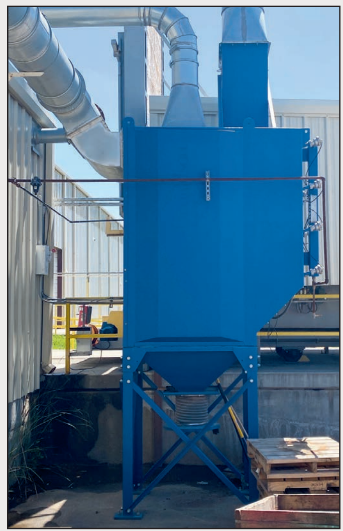
TORIT DONALDSON DUST COLLECTOR