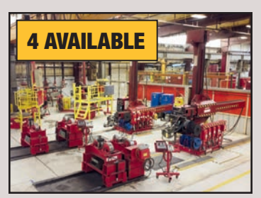
VIEW OF SUBARC WELDING CELLS