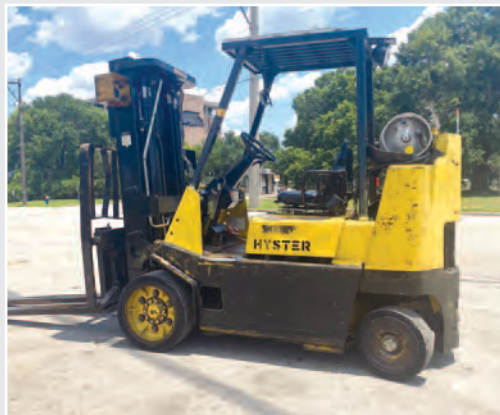
• 8,000 Lb. Hyster Model S80XLBCS Forklift