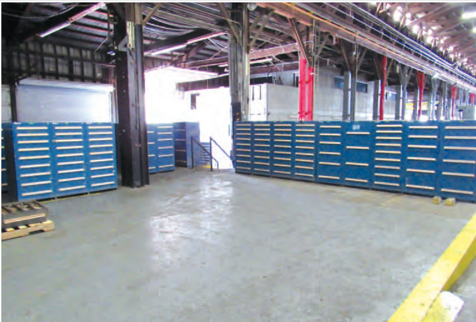
• Vidmar Cabinets, Lots to Choose From – Great Condition

Inspection: Monday, July 13, 9:00am to 3:00pm CDT • 3609 Clinton Dr., Houston, TX 77020