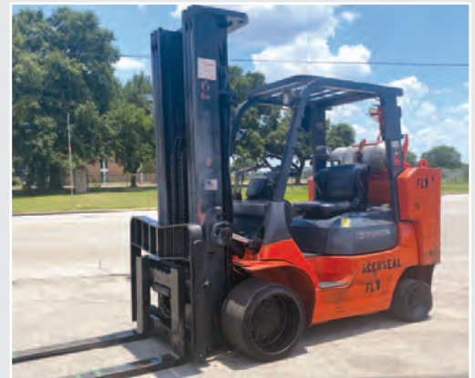
• 10,000 Lb. Toyota Model 7FGCU45-BSC Forklift