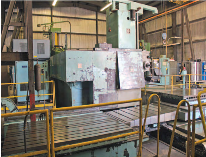
• 7" Giddings & Lewis MC-70 Twin Pallet CNC HMC, 7" spindle, 144" X / 103" Y / 60" Z / 118" W, 12-2200 rpm, 107 hp, (2) 60" x 96" pallets, Numeripath 8000B CNC