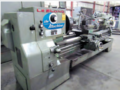
• 26" x 68" LeBlond "The Machine" Engine Lathe , 14-1080 rpm, 2-1/8" bore, inch threads, 18" 4-jaw chuck, taper, tailstock, coolant