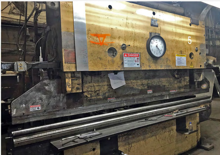
• 12' x 200 Ton HTC Mdl 200-12R Hydraulic Press Brake, 200 ton cap., 144" die length, 101" btwn hsgns, 5" ram stroke, 11.5" open ht., 8" throat, 20 hp, 4-way die