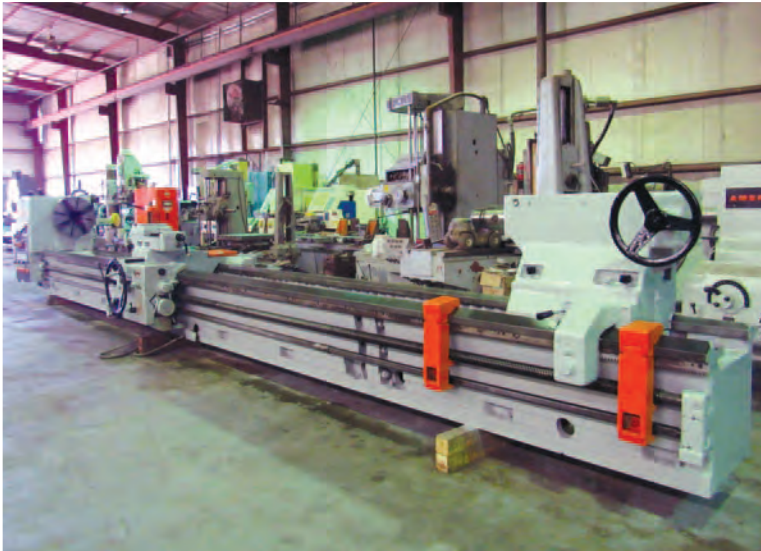
• 41" x 314" Sigma Tos SU-100 Engine Lathe, 2.2-450 rpm, 4.1" spindle bore, inch/metric threads, 24" 3-jaw chuck, 40" 4-jaw chuck, Aloris tool post, (3) steady rests, tailstock, taper attach.