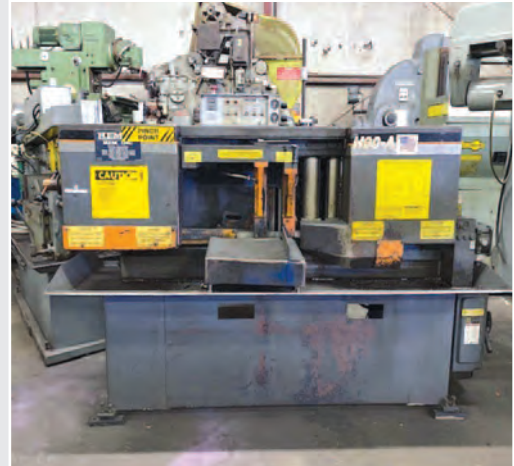
• HEM H90 A-B/F Auto Horiz. Bandsaw, 1999, 12.75" x 12.75" cap., 60 - 300 fpm, 3 hp, 0" - 24" feed stroke