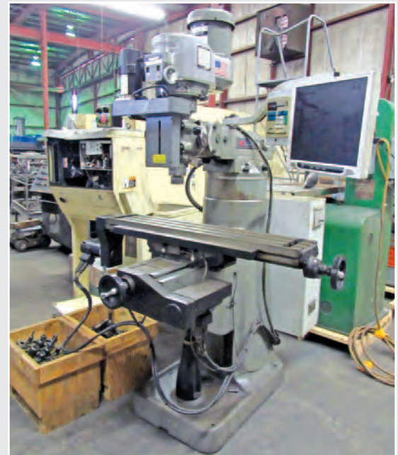
• Bridgeport EZ Trak Series I CNC Vertical Milling Machine, 9"x48" table, 4200 rpm, 2 hp, EZ Trak CNC