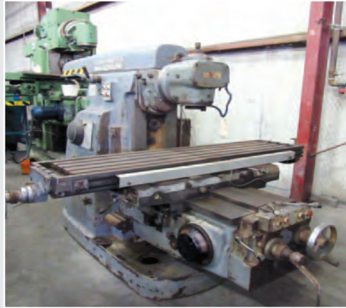
• Cincinnati Milacron 315-16 Plain Dial Type Horiz. Mill, 16" x 72" table, 16-1600 rpm, 15 hp, #50 NS taper, Newall 2-axis DRO