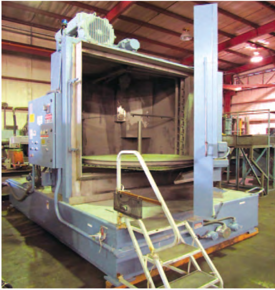
• 60" Proceco Typhoon-HD Table Type Parts Washer, 60" dia. x 60" ht. max. work piece, 2500 lb. load cap., (2) recirc. stages, 140-180 F