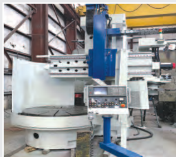
• 59" Toshiba TUE-15 Hi-Column CNC VBM