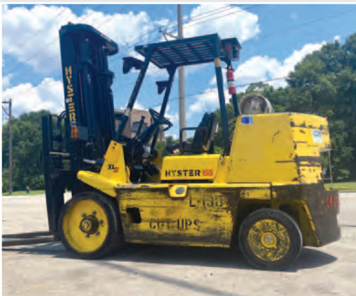
• 15,000 Lb. Hyster Model S155XL2 Forklift