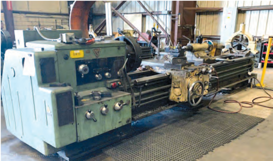
• 26" x 120" Ryazan Engine Lathe, 26" swing, 14" over cross slide, 120" centers, 10 - 1250 rpm, 27hp, 3-3/8" spindle bore, 20" 4-jaw chuck, inch/metric threads, tailstock, taper attach., steady rest, 4-way tool post, chuck guard, coolant