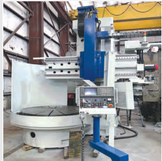
• 59" Toshiba TUE-15 Hi-Column CNC VBM, 70.8" max. dia., 59" max. height, 2-250 rpm, 60 hp, ATC, Fanuc 18T CNC