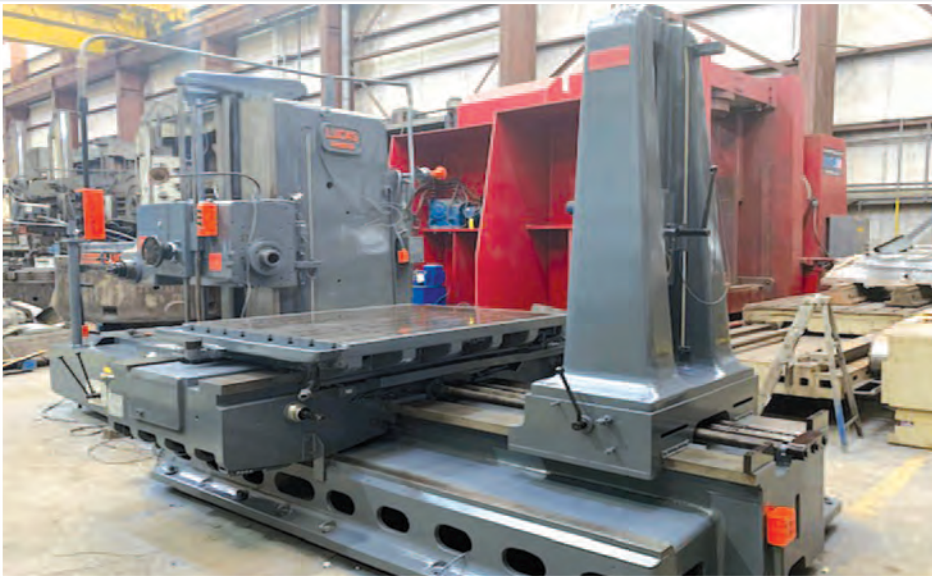
• 5" Lucas 542B-60 HBM, 5" spindle, Morse #7, 48" x 62" table, 9 - 1200 rpm, 20 hp, tailstock, Newall DRO's