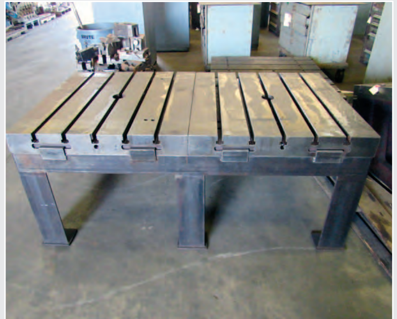
• T-Slotted Tables, (2) 36" x 36" T-Slotted tables on steel base, 27" high