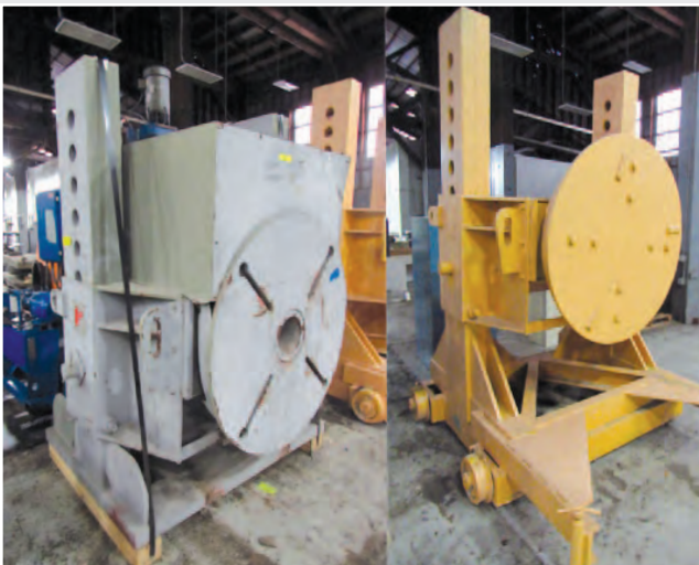
• 24,000 Lb. Ransome 7-H / 7-T Positioner, 46" table dia., 12" G.C., 12" ecc., 7.5 hp