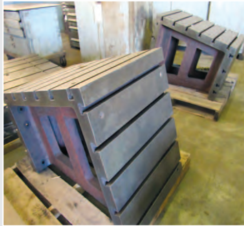
• Lot of (2) T-slotted Angle Plates , 24" wide with (3) T-slotted faces 36" / 30" 22" in length)