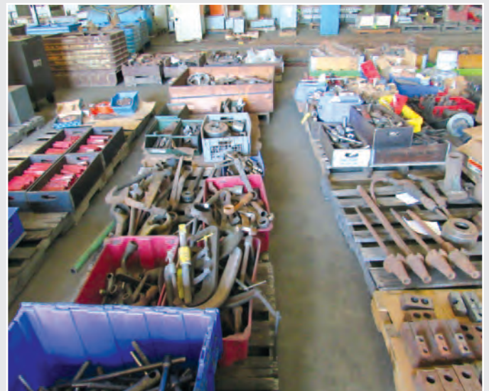
• Tooling, Thousands available