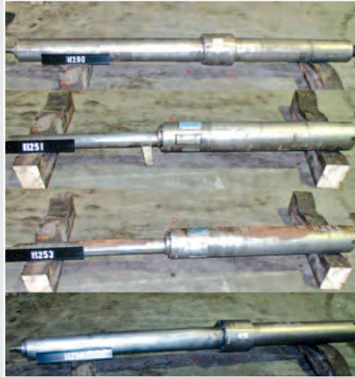
• Setco Grinding Spindles, Five to choose from, 77"-92" lengths, 4"-6" dia.