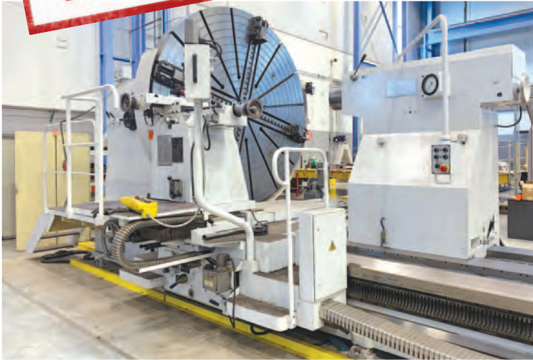
• 122" x 240" Poreba TCS 305-3/3 X 5M HD Lathe, New 1999, 0.5-100 rpm, 100 hp, 110" 4-jaw chuck, threading, motorized tailstock, 3 axis DRO

100,000 SQ. FT. LEASE LOST – Complete Site Sale to Include: All Machine Tools, Equipment, Rolling Stock, Tooling, Accessories, Shop Support, Cabinets, Electrical Supplies, Tool Room Equipment, (100+) Vidmar Cabinets & Much More!