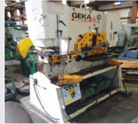
• 70 Ton Geka-Hydracrop HYD-70 Ironworker , angle cut-off, flat, round, square, punch, 3" stroke, 20" throat