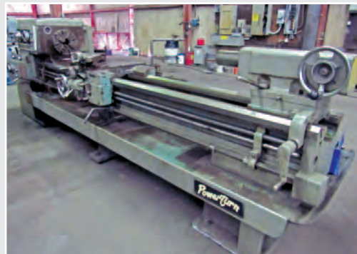
• 20"/13" x 102" Lodge & Shipley 2013 Powerturn Engine Lathe , 21-1740 rpm, 2-1/16" bore, inch threads, 12" 4-jaw chuck, tailstock, taper, coolant