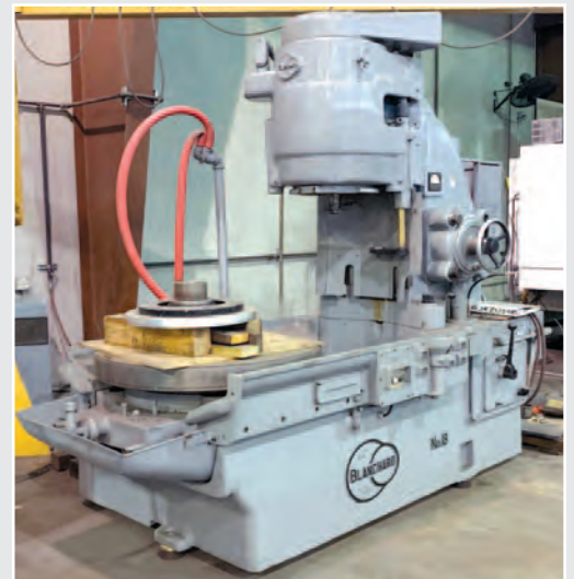
• 36" Blanchard 18-36 Rotary Surface Grinder, 36" mag. chuck, 40" swing, 6-33 rpm chuck, 18" grinding wheel, 720 rpm wheel, 40 hp, updated controls, neutrifier, machine record. 2018