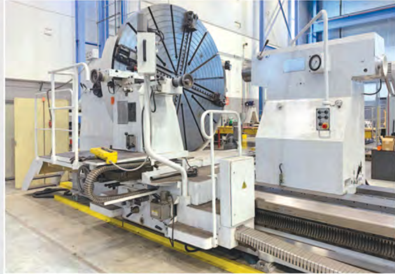
• 122" x 240" Poreba TCS 305-3/3 X 5M HD Lathe, New 1999, 0.5-100 rpm, 100 hp, 110" 4-jaw chuck, threading, motorized tailstock, 3 axis DRO