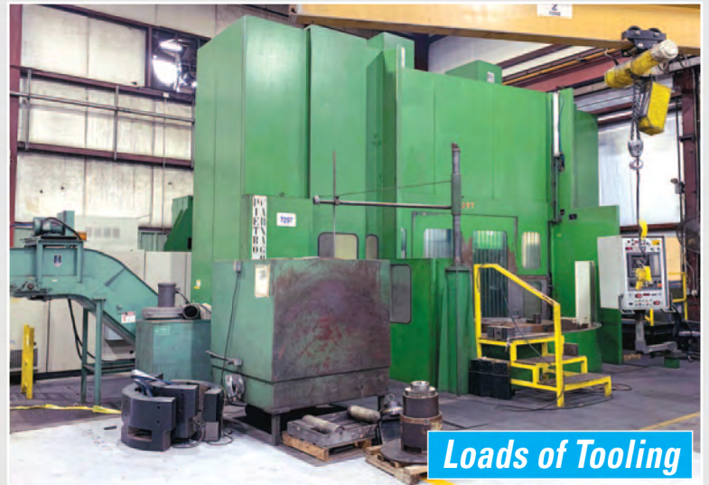
• Pietro Carnaghi AC16TT 4 Axis Twin Pallet CNC VBM, 1998, (2) 49" pallets, 63" max. turning, 74" under rail, 1.7-380 rpm, 100 hp, Fanuc 15TTCNC