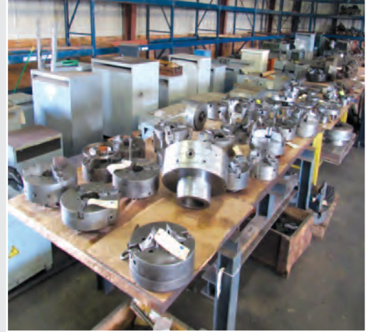
• Hundreds of Chucks of all Sizes Available