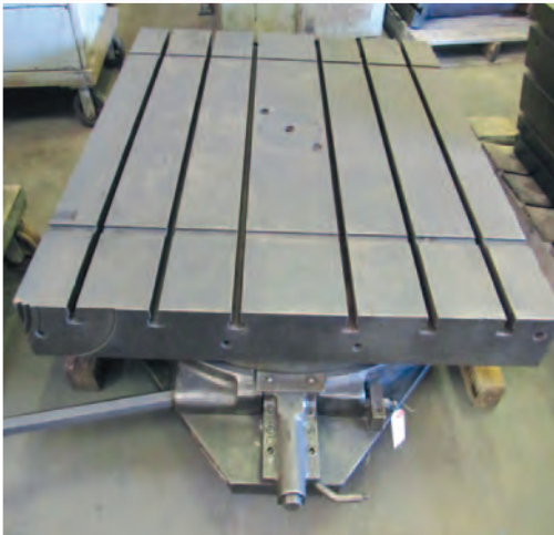
• 48" x 48" x 5.5" T-slotted Hyd. Rotary Table