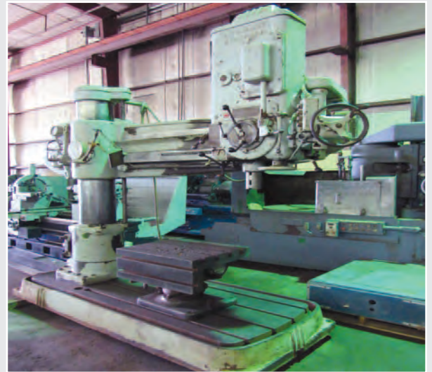
• 4' 13" Cincinnati Bickford Super Service Radial Drill, 48" arm, 13" col., 60" under arm, 21 - 2300 rpm, 10 hp, #5 Morse, 4" spindle dia., 18" spindle travel, tilt box tbl, pwr elev., pwr clamp, rapids, coolant