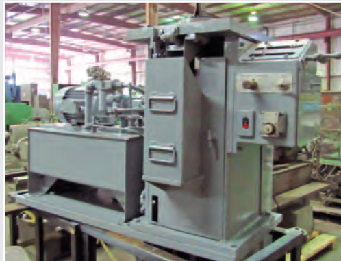
• Mitts & Merrill 3-AHFRD-KS Keyseater , 24" max. length, 1/8" - 2" width, 3-3/8" std post, 7.5 hp motor, T-slotted table