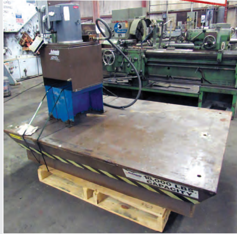
• Autoquip 18,000 Lb. Hyd. Lift Table , 52" x 70" table, 14" lowered ht., 36" lift stroke, 5 hp hyd. power pac, up/down push button controls