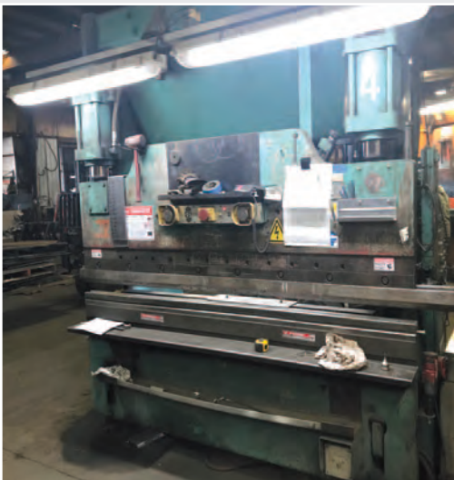
• 6' x 90 Ton Cincinnati 90CB Hyd. Press Brake, 90 tons, 72" die, 78-1/2" btwn housings, 8" stroke, 15" open ht, 7" throat, 15 hp, dual palm control, 4-way die