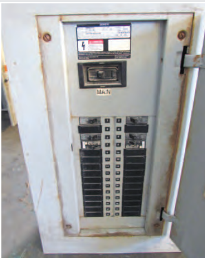
• AMP Siemens Type S3 Circuit Breaker Box, Dozens to choose from, 15 KVA to 225 KVA