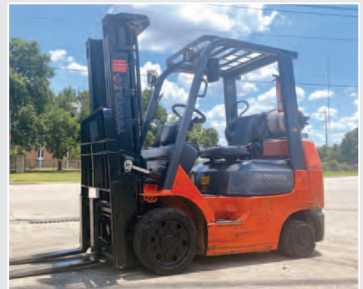
• 5,000 Lb. Toyota Model 42-4FGC25 Forklift