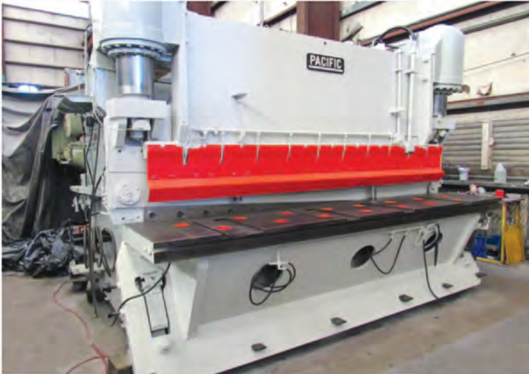
• 10' x 1" Pacific 750-S10A Hydraulic Power Squaring Shear, 124" knives length, 18" throat, 40 hp, adj. rake, squaring arm