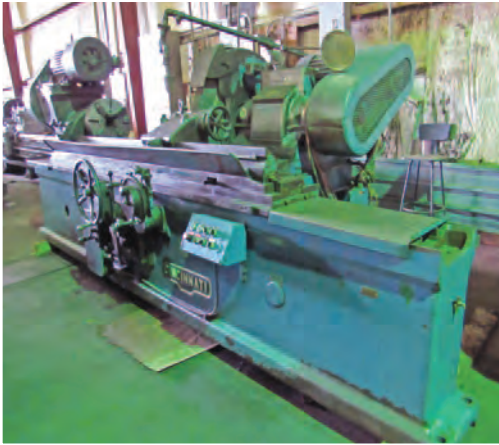
• 17" x 72" HD Cincinnati Plain Cyl. Grinder, 17" swing, 72" ctrs, 36"x3" grinding wheel, 20 hp, 15" 4-jaw chuck, tailstock, work rests, coolant/hyd. syst.