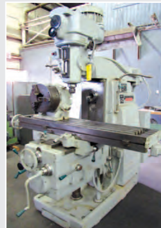
• Kearney & Trecker Milwaukee 205 S-12 Horiz. Mill, 12" x 56" table, 25-2000 rpm, 5 hp, No. 50 taper, 12" 3-jaw rot. tbl