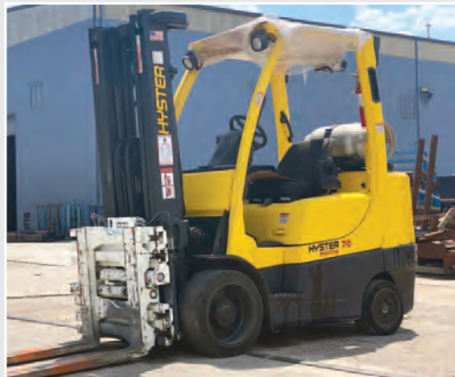
• 5,000 Lb. Hyster Model S70FT Forklift