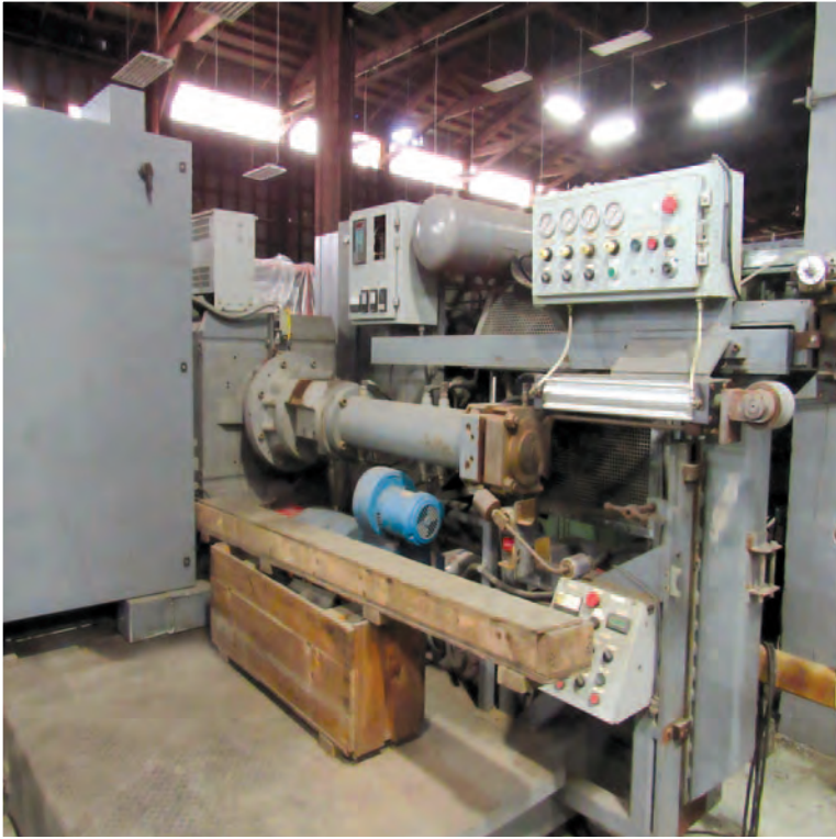
• NRM Extrusion Extruder , 1997, 3.5" size, L/D: 12:1, 75 hp, air cooled, 300 psig, single screw type, mounted on var. speed travel car, 3 temp. zones