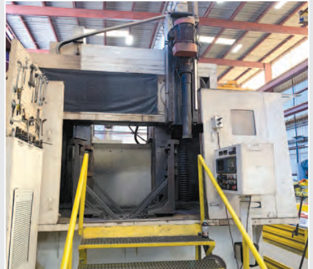
• Springfield 48 CNC High Column CNC I.D / O.D. Vertical Grinder, 48" dia. table, 72" swing, 72" under rail, 5-100 rpm, 10 hp, GE Fanuc 15-T CNC, wheel dresser, coolant