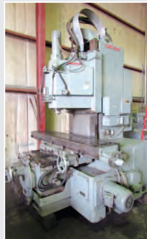
• Cincinnati 550-20 Vercipower Vert. Mill, 20" x 94.5" table, 14-1400 rpm, 50 hp, 50 taper