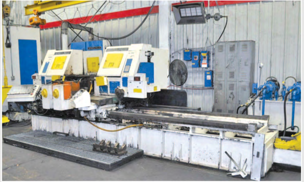
• Seneca Falls MC 150 Facing/Centering Machine, 0.75" - 12" OD cap., 40" swing, 120" ctrs, (2) 20 hp mtrs, 294-1256 rpm drill, 78-333 rpm mill, dual oper. cntrls, coolant