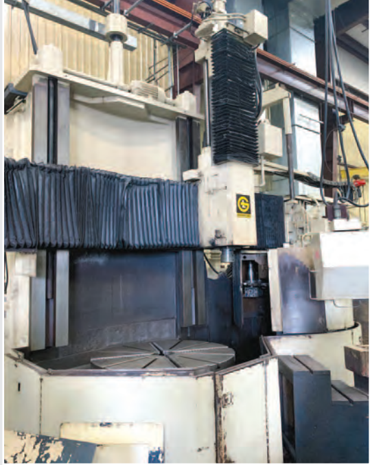
• 48" Giddings & Lewis VTC48 CNC VTC, 60" swing, 72" under rail, 4-320 rpm, 60 hp, tool changer, tool turning/boring tool holders, FOR RETROFIT