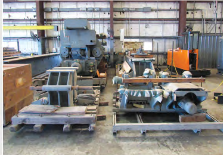
• 1000 Ton Verson Allsteel 1000-HD1-ST Traveling Gantry Straightening Press, 30' x 36" bed size, 40" btwn col., 24" stroke, 30" shut height, on U.S. government skids