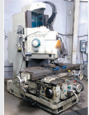
• Cincinnati Vercipower Vert. Mill, 18" x 72" table, 16-1600 rpm, 20 hp, 50 taper