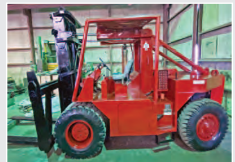
• 45,000 Lb. Taylor Forklift

Looking to sell surplus machinery & equipment or an entire facility?