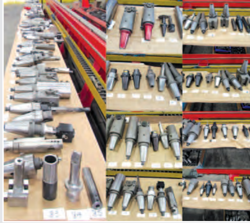
• CAT 60 Tooling, Sandvik Coromant, G&L Davis, Kennametal, Parlec and more (Over 100 Pieces Available)