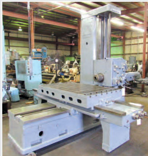
• 4" Wotan B100L Table Type HBM, 4" spindle, 40" x 68" table, 70.8" cross trvl, 39.3" long. trvl, 49.2" headstock vert. trvl, 14-1600 rpm, 4-axis Newall DRO