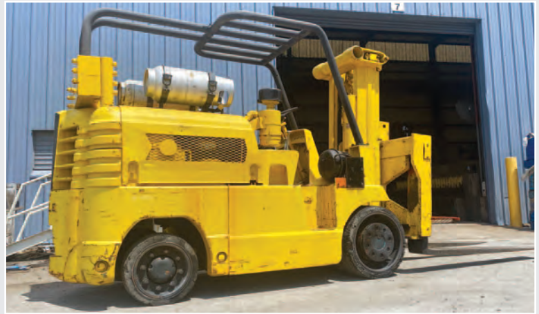
• 20,000 Lb. Yale Model L5-200-FAS-G Forklift