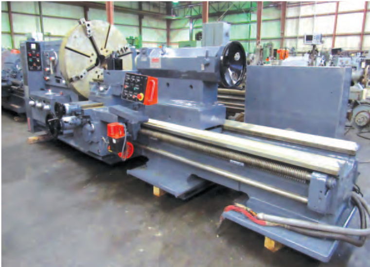
• 45" x 78" Poreba TR-115B2/78 Engine Lathe, New 1998, 4.75" spindle bore, A1-15 nose, 5-500 rpm, inch/metric threads, 42" 4-jaw chuck, steady rest, tailstock, taper attach., Newall DRO