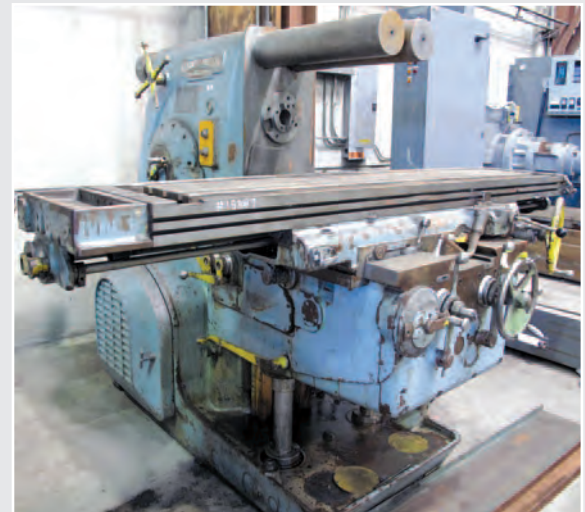
• Kearney & Trecker 425TF Plain Horizontal Mill, 88" x 17" tbl, 13-300 rpm, 25 hp, No. 50 taper, double overarm