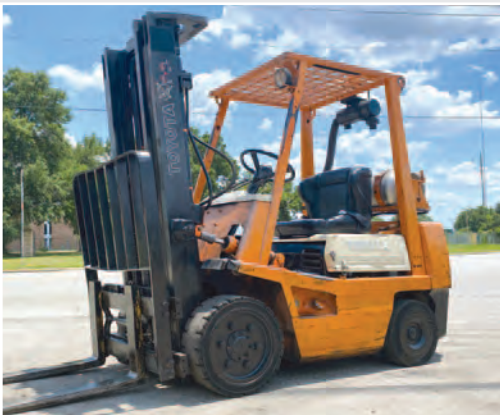
• 4,700 Lb. Toyota Model 42-4FGC25 Forklift