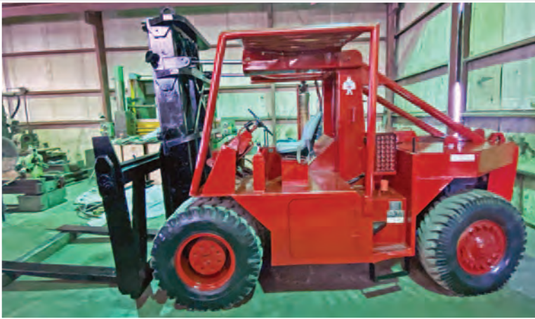
• 45,000 Lb. Taylor Model Y-45-WOS Forklift