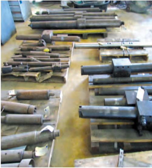
• Dozens of assorted size boring bars available

Inspection: Monday, July 13, 9:00am to 3:00pm CDT • 3609 Clinton Dr., Houston, TX 77020