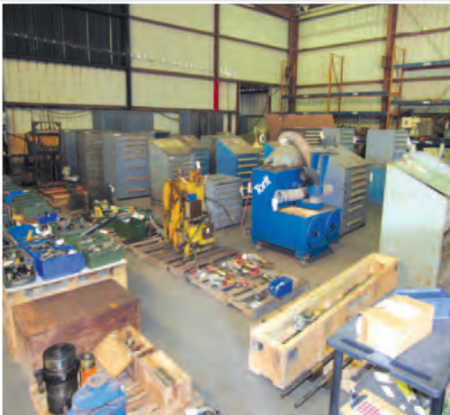
• Lots and lots of tooling to choose from