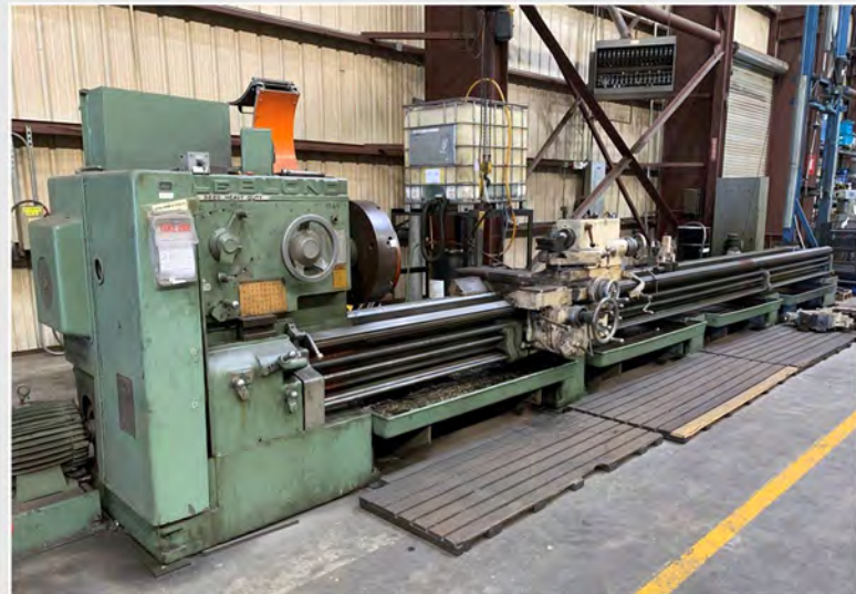
• 32" x 312" LeBlond 3220 HD Engine Lathe, 32" swing, 20.5" over cross slide, 312" centers, 10 - 1300 rpm, 30 hp, threading, 24" 4-jaw chuck, tailstock, steady rests, Aloris tool post