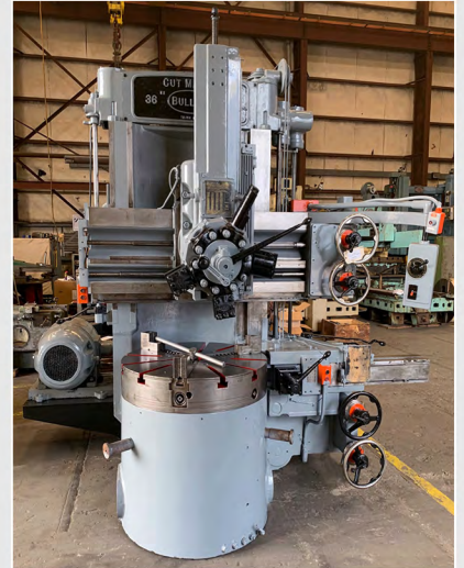
• 36" Bullard Cutmaster VTL, 36" tbl, 45" swing, 30" under rail, 3.3 - 240 rpm, 30 hp, swivel turret head, side head