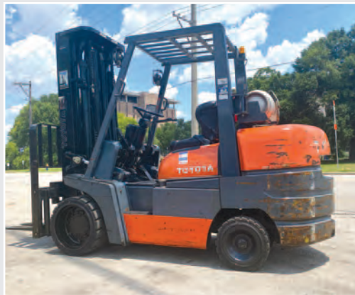
• 10,000 Lb. Toyota Model 52.6FGCU45 Forklift