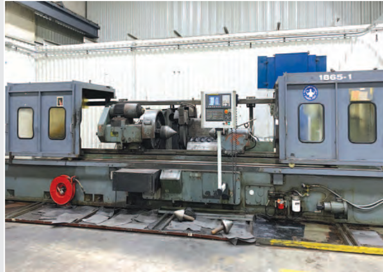
• 24" x 120" TOS-Hostivar BUT 63-3000 CNC Cylindrical Grinder, 2-200 ipm table speeds, 935 rpm grinding wheel, 25 hp, 9-57 rpm work head speeds, 10 hp, Fanuc Oi-MATE-TD