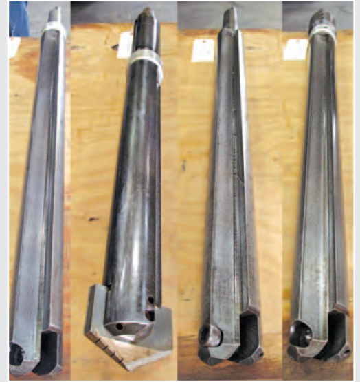
• Hundreds of Drill Bits and Other Tooling Available