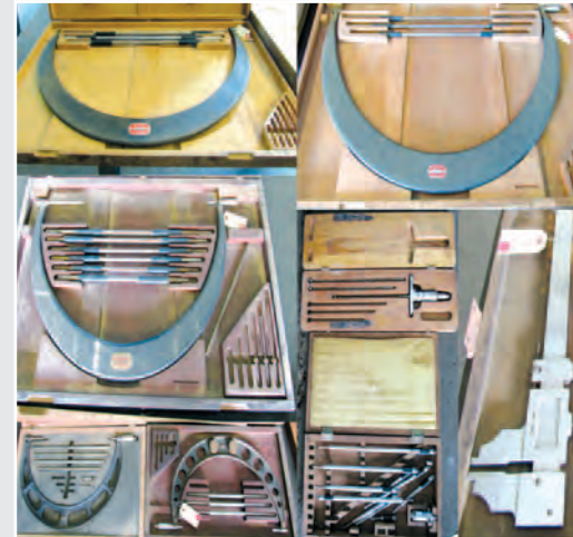
• Starrett and other QC Tooling