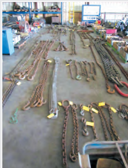
• Rigging Chains, Assorted lengths available