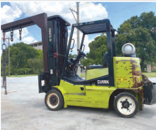
• 10,000 Lb. Clark Model CGC50 Forklift