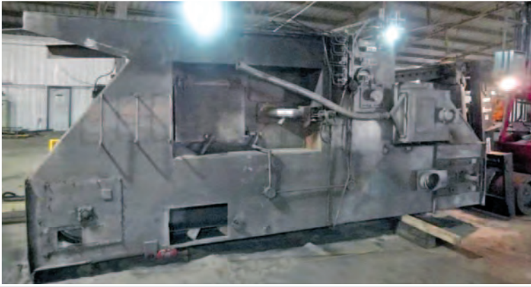
• Pangborn Pass Through O.D. Pipe Blasting Unit , blast unit, hopper, (2) pipe rollers/handlers, motor, hydraulic ram, ducting & dryer