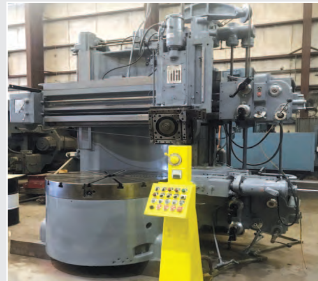
• 54" Bullard VTL, 54" table (4-jaw), 58" swing, 44" under rail, 2.2-160 rpm, 30 hp, side head, new electrics 1992, new PLC unit 2018