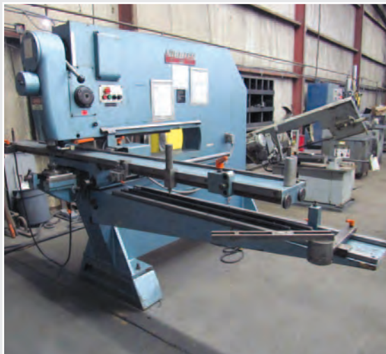
• Fabriks Faximil 6CCN 1000 Nibbler, 250-1400 spm, 2-8 mm adj. stroke, 1330 mm projection, 1.5 kW