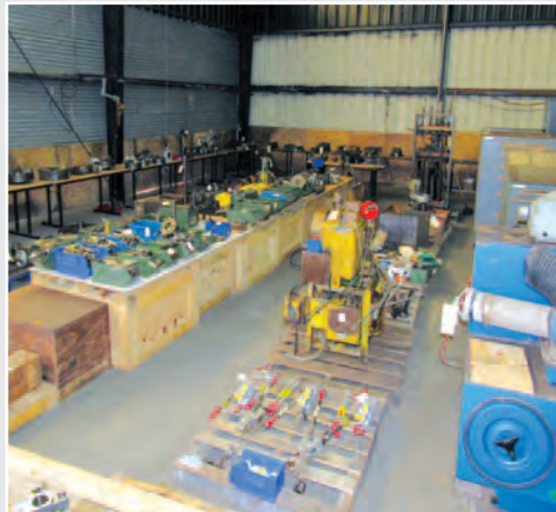
• More tooling!