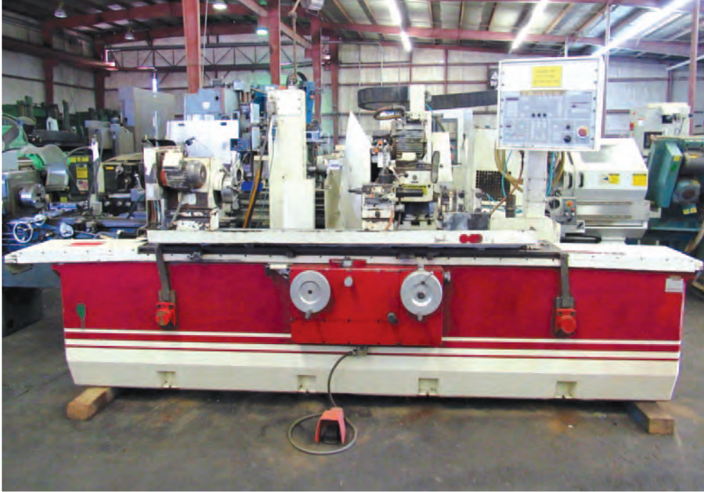
• 17" x 63" Studer S40-2 Cylindrical Grinder, 5.5" x 64" table, 20-900 rpm workhead, 1150 rpm grinding wheel, 10 hp, 2-217 ipm table speeds, work chuck, tailstock, plunge grinding, spark out