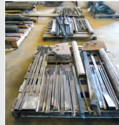
• Large Assortment of Tooling