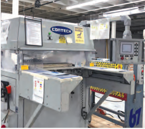
• Contech UP2028 Shuttle Bed Die Cutting Press, with Hydraulic Unit