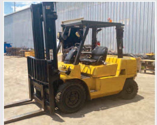
• 8,000 Lb. CAT Model DP40KL Forklift