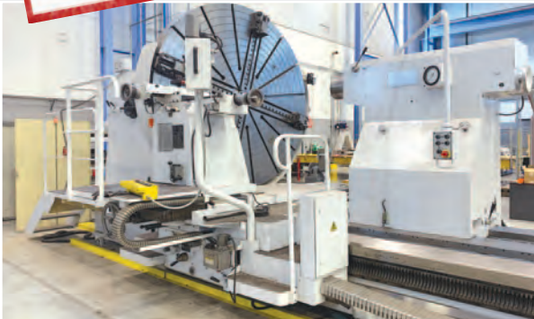
• 122" x 240" Poreba TCS 305-3/3 X 5M HD Lathe

100,000 SQ.FT. LEASE LOST – Complete Site Sale to Include: All Machine Tools, Equipment, Rolling Stock, Tooling, Accessories, Shop Support, Cabinets, Electrical Supplies, Tool Room Equipment, (100+) Vidmar Cabinets and Much More!