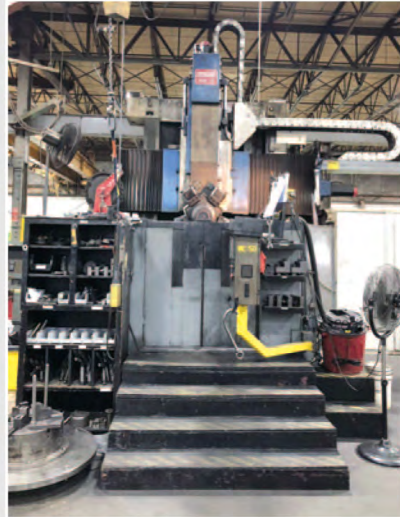
• Monarch VLN 12 CNC VTL, 47" tbl, 61" swing, 55.7" max. part ht, 3.3-280 rpm, 50 hp, Fanuc 18i-T CNC