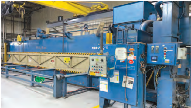
• Pangborn Rotor Blast Machine , for Downhole Mud Rotors, 1991, 5" max. dia., 20' 8" max. length, 0-12 rpm rot. speed, 36" high x 24" long door, dust collector, head and tailstock on work cart, prog. blast nozzle, pressure pot