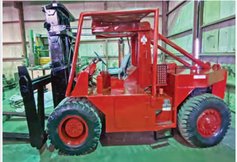
• 45,000 Lb. Taylor Model Y-45-WOS Forklift