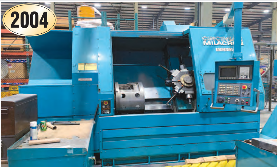
• Cincinnati Milacron Cinturn 28C CNC Valve Chucker Lathe, retrofit 2004, 50" swing over bed, 900 rpm, 50 hp, 10" bore, 28" O.D. 4-pos. valve indexing chuck, Fanuc Oi-TB CNC